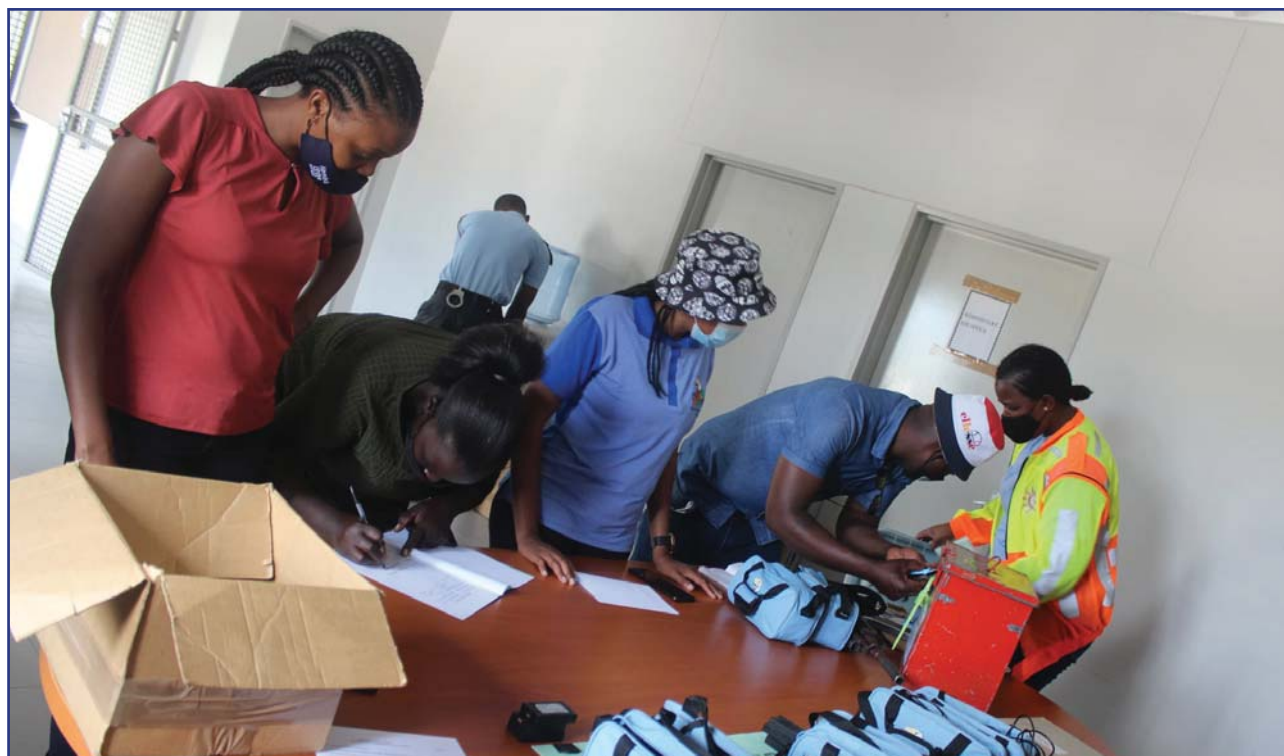
Distribution of sensitive election materials at the Bunya Police Station

The sensitive registration materials for the SRV process were dispatched on 08 th October 2021 under strict security escort of the Namibian police in line with the ECNs Standard Operating Procedures (SoP).