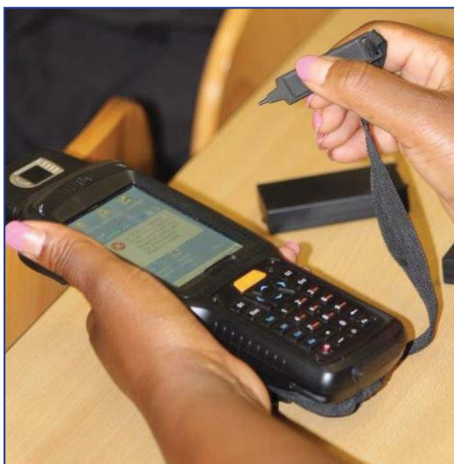
An election official using a VVD to authenticate voters at a polling station

Voter Verification Devices (VVDs) serve to verify and authenticate all eligible voters before allowing them to cast their vote. On each verification device, the voters' register for the Ncamagoro Constituency was loaded. Minor issues with the VVDs were encountered, however these were quickly resolved by the presiding officers without causing any delays.