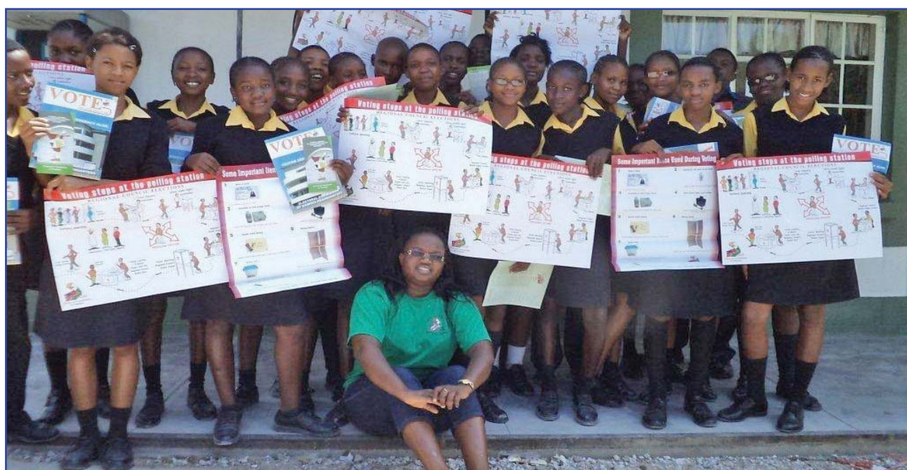
Voter and Civic Education sessions held with school going children to educate them on the importance of voting.

The Commission is required by section 49 of the Electoral Act, Act 5 of 2014, to provide voter and civic education for Namibian citizens. The voter education campaign for the Ncamagoro Constituency commenced on 1 st – 14 th October 2021 for the SRV process.