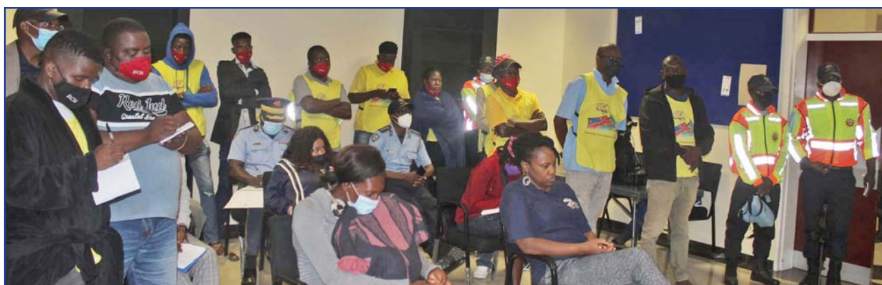
Analysis of results at the collation centre

Vote counting began as soon as the polls closed at 21h00 pm. The results were counted at each polling station after the polls closed, as required by the Electoral Act. The presiding officers announced and displayed the results for the specific fixed or mobile stations at the polling stations in the prescribed manner. Following that, the teams traveled to the collation centre, where the Returning Officer announced and posted at the collation centre, the preliminary results for the Constituency. The final election results were announced by the Chairperson of the Commission on Saturday, 18 th December 2021. The official election results were published in the Government Gazette No. 7741 on the 09 th February 2022.