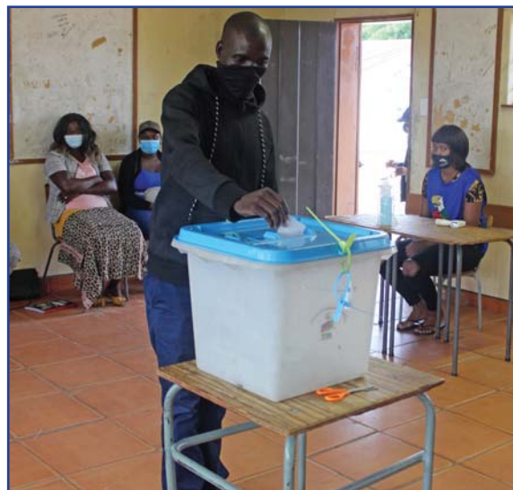
A voter casting their ballot during the polling process.

The Ncamagoro Constituency by-election took place on 17 th December 2021 from 07h00 am. All polling stations opened on time and the voter turnout during the voting process began slowly, particularly in the inland areas, but picked up in the mid-morning and evening hours. The voter turnout at Mbeyo polling station (Team 102) and Ncamagoro Combined School polling station (Team 101) started to increase drastically in the evening. ECN officials paid physical visits to some of the teams, making observations and providing assistance during polling. It should be noted that some political parties did not have the capacity to deploy election agents at all polling stations; therefore, only some polling stations had party agents from all participating political parties and candidates.