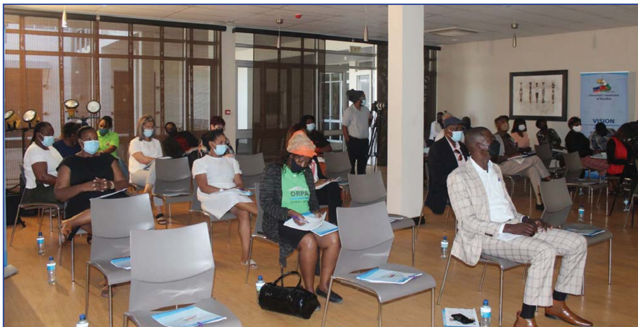
Stakeholders consultations session with members of the Political Party Liaison Committee (PLC).

The involvement of key stakeholders in electoral processes remains critical, thus a stakeholder meeting was held at the Ncamagoro Constituency Office during the registration and polling processes to inform and clarify all matters pertaining to the by-election. Political parties and candidate representatives attended the meetings. Participants were reminded of their roles, as well as the registration, polling schedule, voter education, and the safety measures put in place to ensure the health and safety of both election officials and eligible voters as elections were held amidst the COVID-19 pandemic.