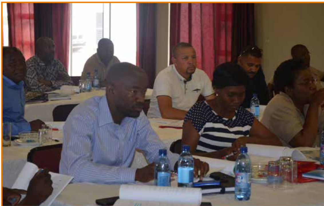
Figure 1: Presiding Officers in training

The officials were also trained on the Election Result Transmission System (ERTS) by Computer Foundation (CF) instructors. Some staff members at the ECN Head Office were also trained as receivers, auditors and release officials.