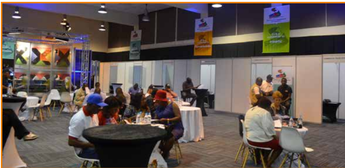
Figure 9: Political parties and media practitioners waiting for the announcement of the election results

The picture of women serving on the Local Authorities is somewhat different from the Regional Councils and National Councils. One can observe progress in the representation of women at Local Authorities levels. Currently there are a total of 371 seats in the Local Authorities. Out of the 371 seats women currently occupy 179 seats and men 192 seats. This means that about 48 % of the elected local authority councillors in 2015 throughout the country are women.