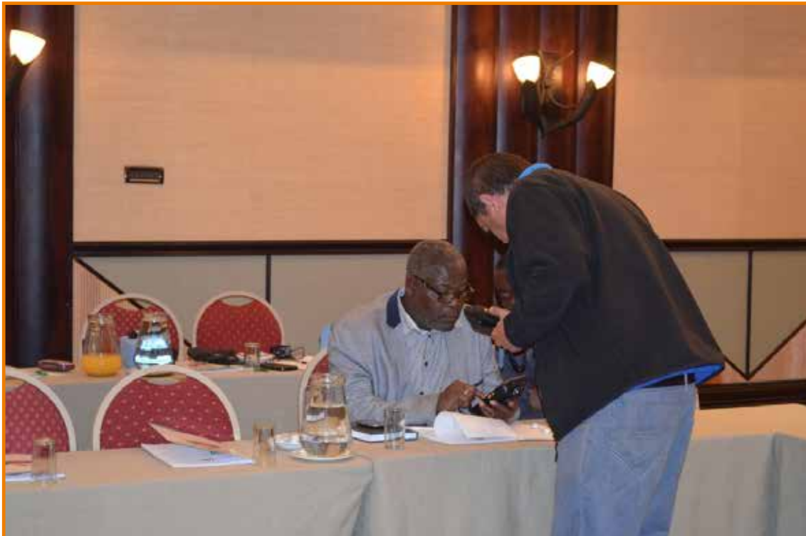
Figure 5: Demonstrating the VVD to the media

To avoid the delays and a repeat of the long queues experienced during the 2014 Presidential and National Assembly elections the ECN made the proper and adequate training of operators of VVDs a top priority. The software of the VVDs was also upgraded so as to speed up the verification of voters at polling stations. VVDs were also used during by-elections. This afforded the operators ample time to gain the necessary operating skills and confidence in handling these devices.