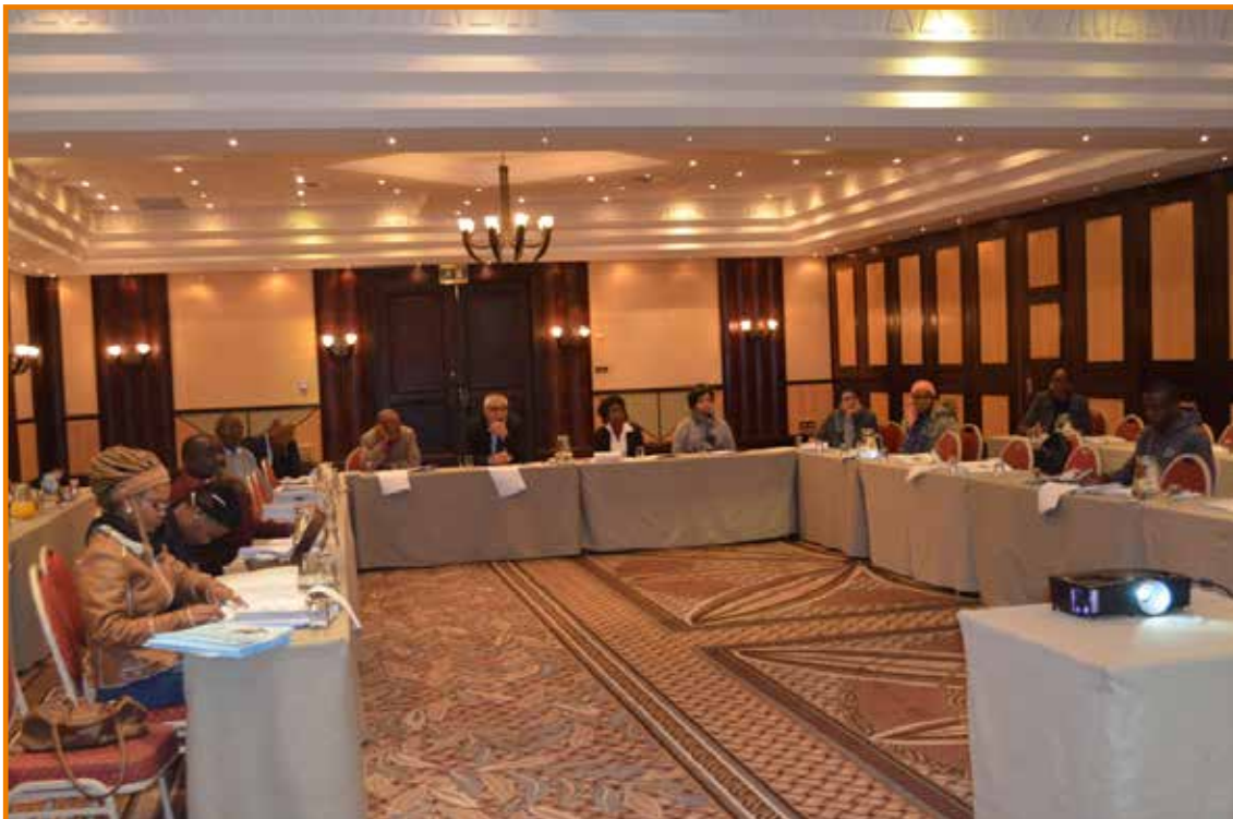
Figure 2: Information sharing with media practitioners

The media workshop was attended by various media houses such as radio, TV and Print media. The majority of those in attendance were from NBC radio services. This platform achieved the objective of enhancing the understanding of media practitioners on electoral issues.