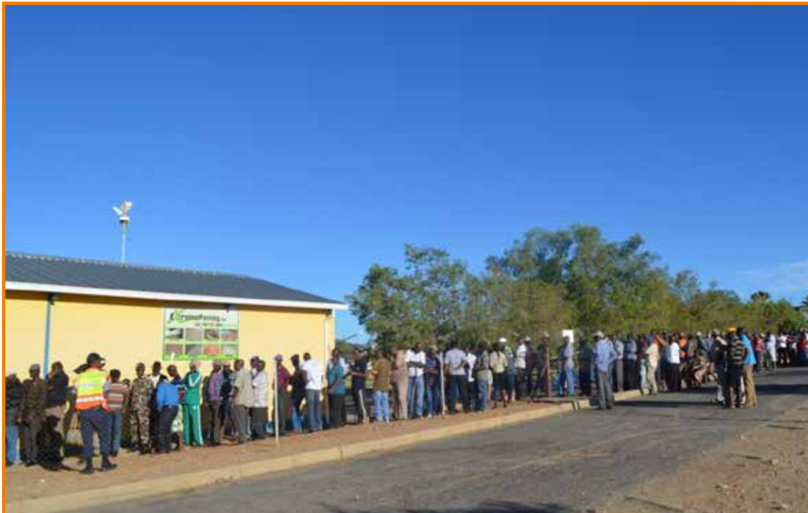
Figure 6: Eligible voters waiting for their chance to vote

Elections for the 2015 Regional Council and Local Authority elections were simultaneously held on Friday, 27 th November 2015. All polling stations opened at 07H00 and closed at 21H00 as prescribed by the Electoral Act. All eligible voters in attendance at 21H00 were allowed to cast their votes as permitted by the law.