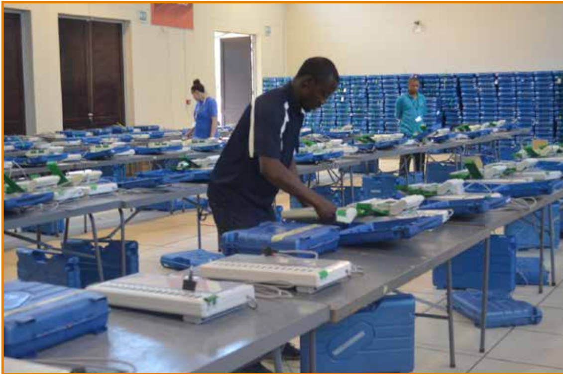
Figure 4: Preparing the EVMs for first-level check