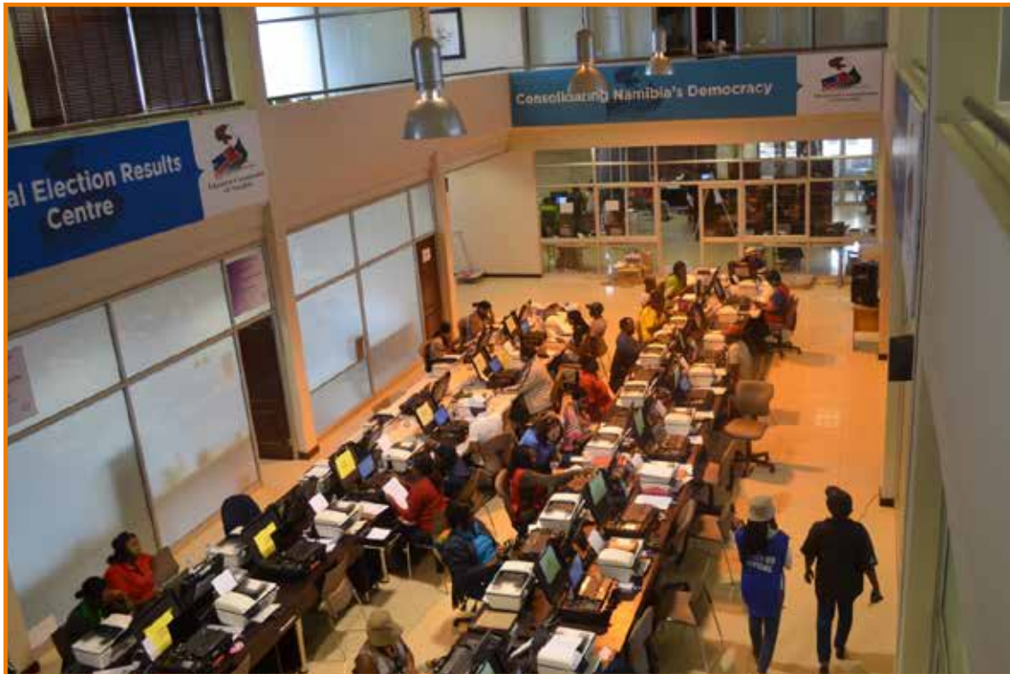
Figure 7: The Central Results Centre at the ECN during the 2015 RC and LA elections

It was initially planned that the receiving, uploading and auditing functions of the system will be decentralized to the collation/constituency centres. The results were then to be transmitted to the Central Result Centre (CERC) located at the ECN Head Office for final endorsement and announcement by the Chairperson of the Commission as provided for in the Electoral Act. However, due to the challenges experienced during the training of Returning Officers it was then resolved, after consultations with all the relevant stakeholders, that the system will be operated from the CERC by ECN staff at ECN Head Office. It was further resolved that the entire process of CERC be reviewed before the next Presidential and National Assembly elections.