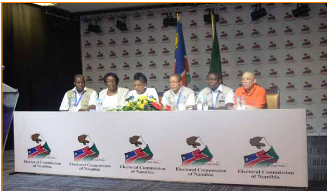
Figure 8: Commissioners and CEO with the Chairperson announcing the results for the 2015 RC and LA elections