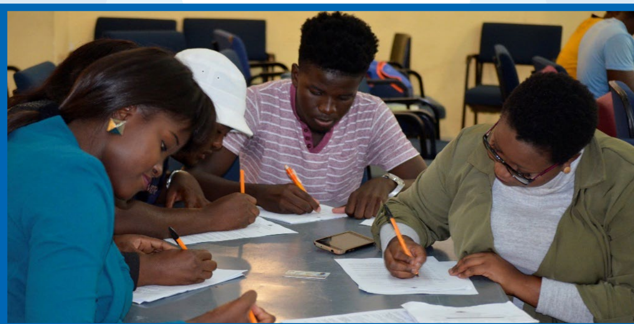
Registration officials wrote a test after training on 24 January 2018 at Government Hall, Rundu.

The training also contained a technical and practical part in that these officials were trained on handling the various electoral equipment and devices. Most of the practical training focused on the EVMs, VVDs, administrative forms (Elect Forms) and the counting process (Tabulator). The Voter Registration Kits (VRKs) and the EVMs were thoroughly tested before the actual registration and polling processes.