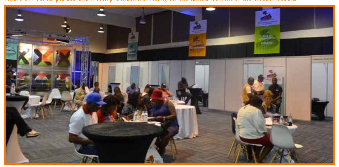
Figure 9: Political parties and media practitioners waiting for the announcement of the election results

The picture of women serving on the Local Authorities is somewhat different from the Regional Councils and National Councils. One can observe progress in the representation of women at Local Authorities levels. Currently there are a total of 371 seats in the Local Authorities. Out of the 371 seats women currently occupy 179 seats and men 192 seats. This means that about 48 % of the elected local authority councillors in 2015 throughout the country are women.