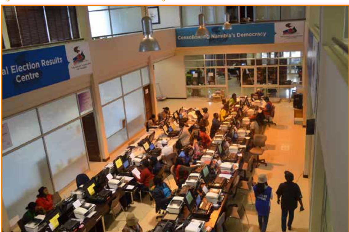
Figure 7: The Central Results Centre at the ECN during the 2015 RC and LA elections

It was initially planned that the receiving, uploading and auditing functions of the system will be decentralized to the collation/constituency centres. The results were then to be transmitted to the Central Result Centre (CERC) located at the ECN Head Office for final endorsement and announcement by the Chairperson of the Commission as provided for in the Electoral Act. However, due to the challenges experienced during the training of Returning Officers it was then resolved, after consultations with all the relevant stakeholders, that the system will be operated from the CERC by ECN staff at ECN Head Office. It was further resolved that the entire process of CERC be reviewed before the next Presidential and National Assembly elections.