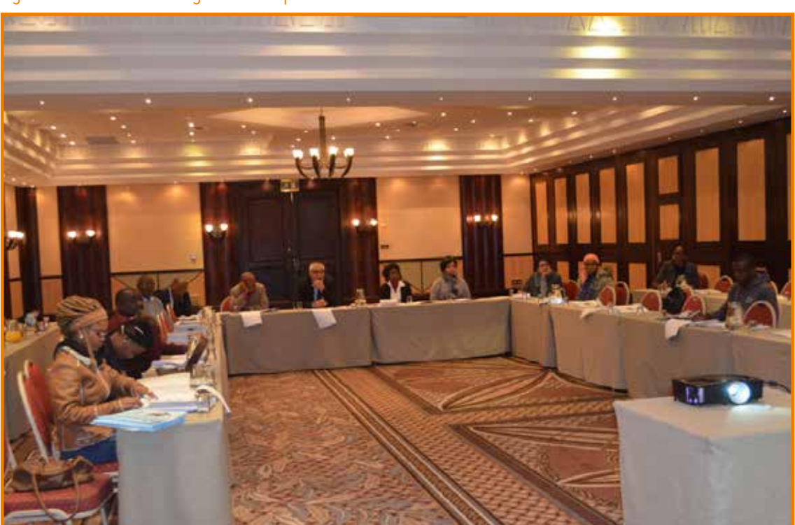
Figure 2: Information sharing with media practitioners

The media workshop was attended by various media houses such as radio, TV and Print media. The majority of those in attendance were from NBC radio services. This platform achieved the objective of enhancing the understanding of media practitioners on electoral issues.